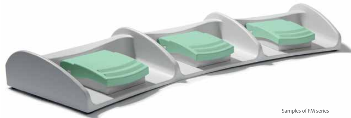
Samples of FM series