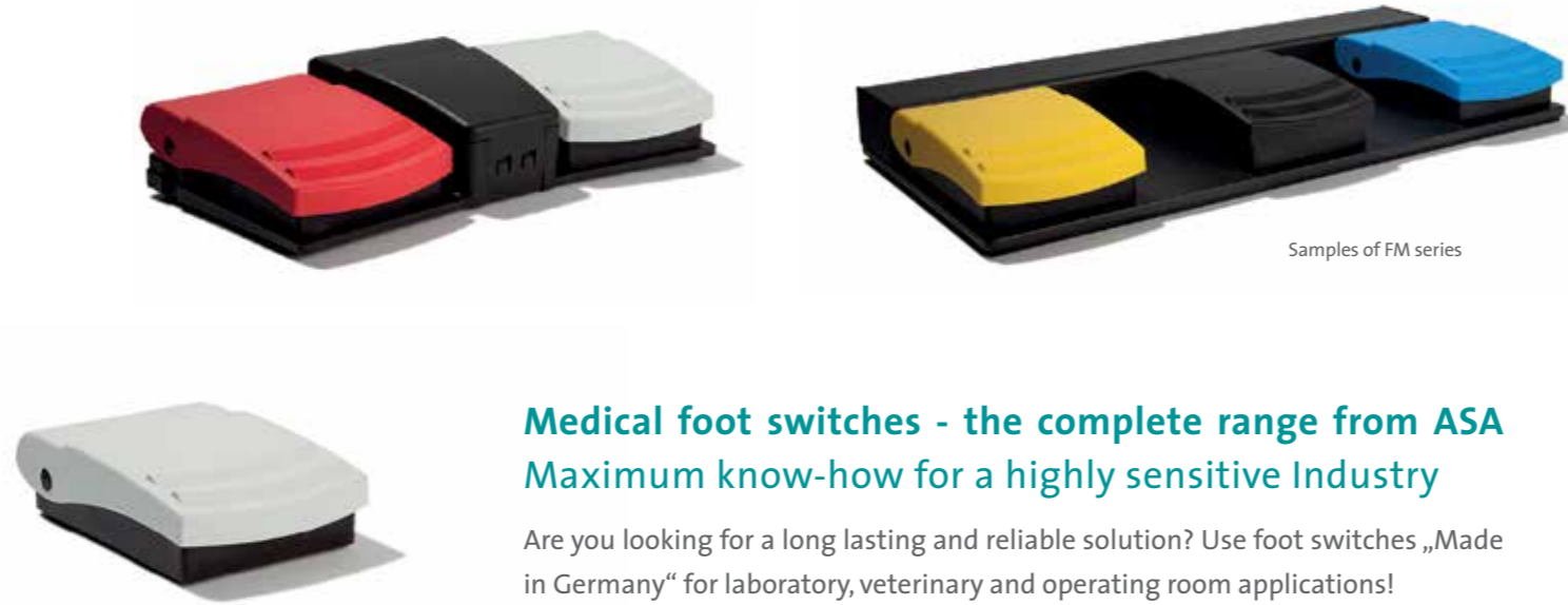
Samples of FM series